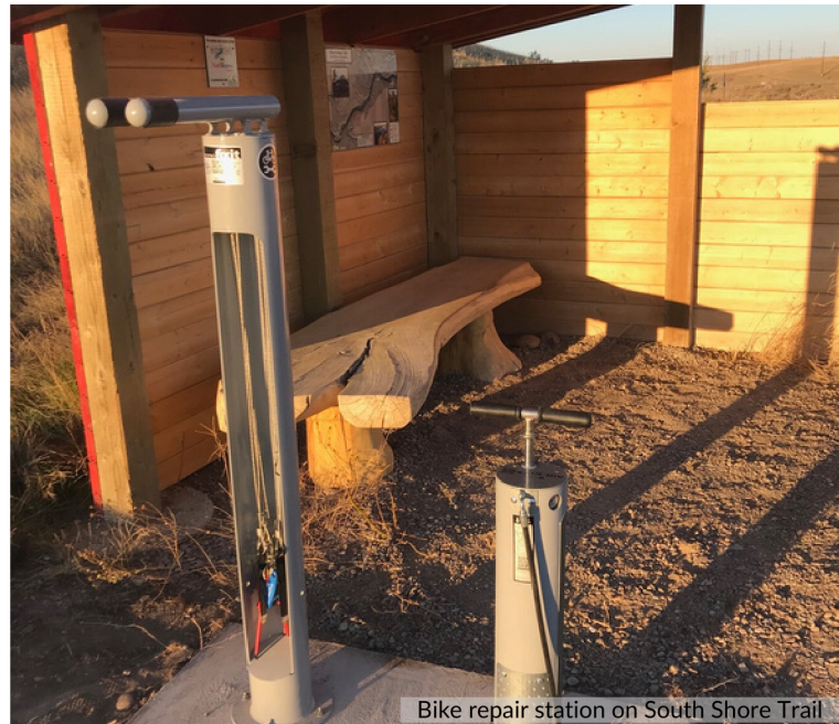
Bike repair station on South Shore Trail

We are grateful to Wilbert and all the other generous donors who allow RETF to develop, maintain and encourage utilization of River's Edge Trail.