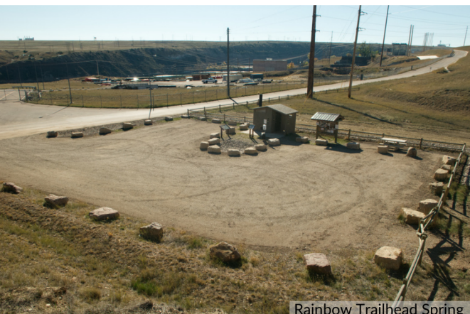
Rainbow Trailhead Spring

The Park and Recreation Trail crew continued their great work on trail maintenance including asphalt sealing, tree planting, signage, trash pick-up, and landscape maintenance including recent improvements to Tourist Park.