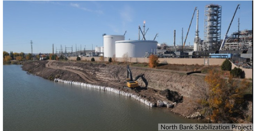
North Bank Stabilization Project

The mitigation project to correct river bank erosion and associated bank slumping is underway as of this writing and should be completed as soon as weather permits. In addition, the Foundation will be involved in the trail repaving project once the mitigation work is complete.