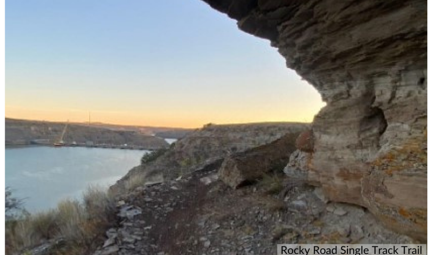
Rocky Road Single Track Trail

On September 27 of 2022, the Historic Tenth Street Bridge was officially connected to River's Edge Trail at both the North and South ends at a ribbon cutting ceremony held on the South approach.