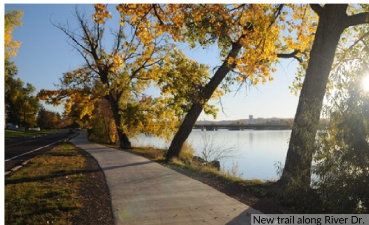
New trail along River Dr.